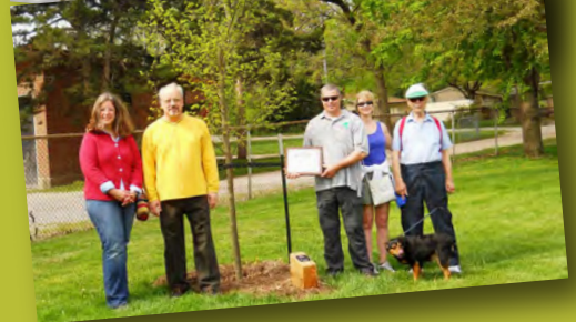
PICTURES, FROM TOP TO BOTTOM: Shop With a Cop, Jazz Fest, Weltner Park, Art Exhibit, Skate Park, Exterior Home Repair ("A Brush With Kindness"), PV Arbor Day (New Tree Planting)