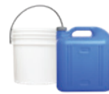
Plastic Buckets (5 gal. and smaller)