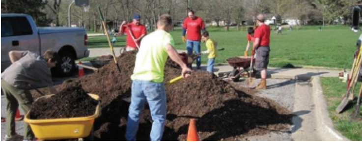
2010 is the 100th anniversary of the Boy Scouts of America. On Saturday, April 10 over 70 local scouts laid over twelve truckloads of mulch in Harmon and Porter Parks.