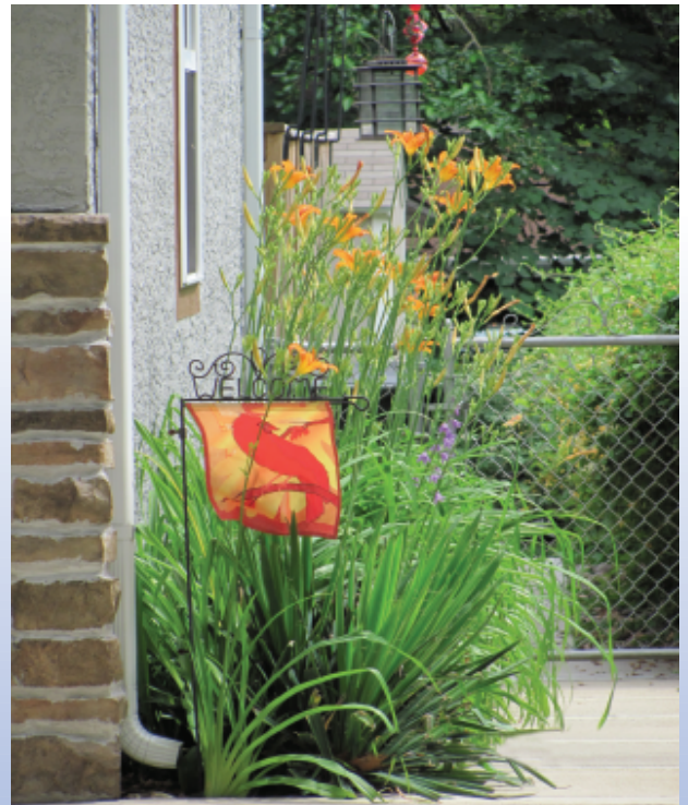
This resident has used landscaping to screen their containers.

Don't forget that during the week of July 5th, collections services will be delayed one day. If you need assistance with the new procedures feel free to call the City at 381-6464 or look on the City's website: www.pvkansas.com .