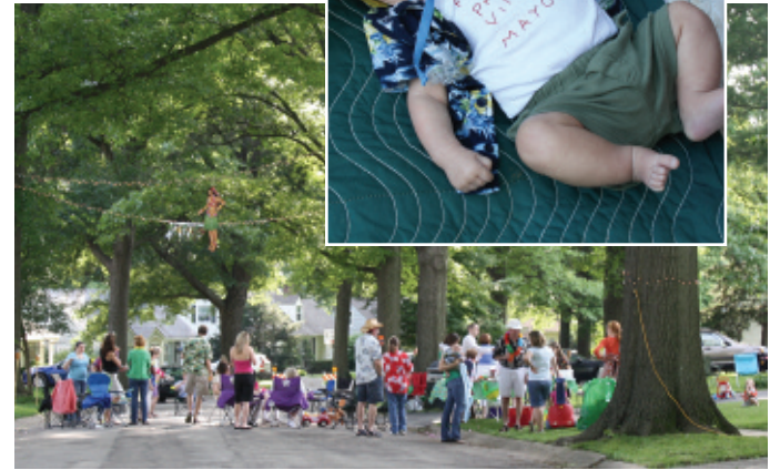
Residents on the 3900 block of West 73rd Terrace held their 2nd Annual Block Party in June.