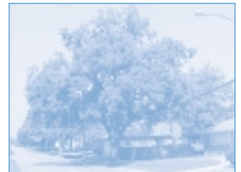
This Champion Tree is a black walnut located at 4630 West 79th Street.

The 2002 Champion Trees and Best of Species will be awarded. There will also be a drawing for trees to be given away during the seminar.