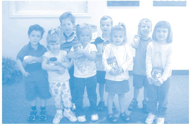
Children from Pam's Day Care delivered peanut butter to City Hall. They collected 70 pounds!

This outpouring of kindness, support and goodwill for such a worthwhile cause is truly appreciated.