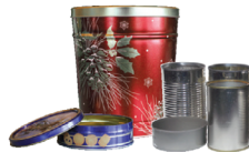
Steel (tin) Cans