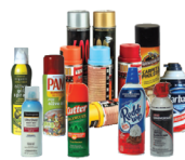
Aerosol Cans (empty only, make no "hiss" sound)