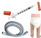
Medical & Personal Hygiene