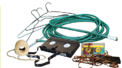
"Tanglers" (long, stringy items)