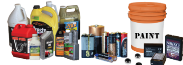
Household Hazardous Waste* (do not recycle empty hazardous waste containers, except empty aerosol cans)

*Other recycling options available, visit RecycleSpot.org