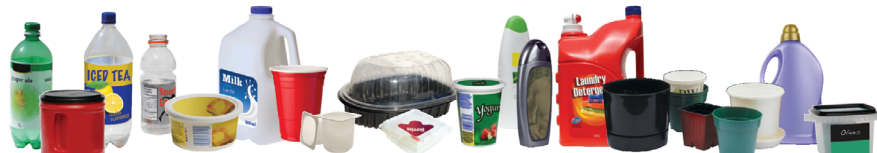
Plastic Bottles & Containers (have #1 - #7 inside arrow symbol on container)