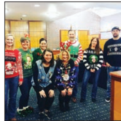
Tacky Sweaters City staff sported their best and brightest holiday sweaters during an employee appreciation lunch in December.