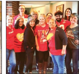
Red Friday City Hall staff wore red to cheer the Kansas City Chiefs to victory in Super Bowl LIV.