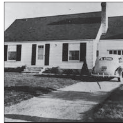
Throwback Thursdays On select Thursdays, we share pictures of Prairie Village's history (like this photo of the 600th home sold in Prairie Village).