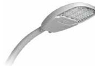
New LED Streetlight

The City currently contracts with Black & McDonald for streetlight repair and maintenance. Residents can report outages, lights that stay on during daylight hours, intermittent lights, and any other damages or maintenance needs by calling 913-385-4647. Reports can also be made on the City website at pvkansas.com/servicerequest .